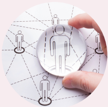
Human Resource Management