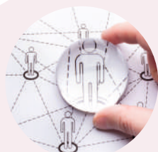
Human Resource Management